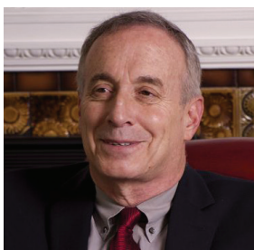
Laurence J. Kotlikoff Professor of Economics Boston University